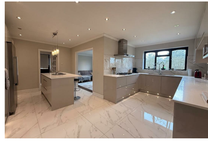
HOUSE - DETACHED (EPC RATING: )