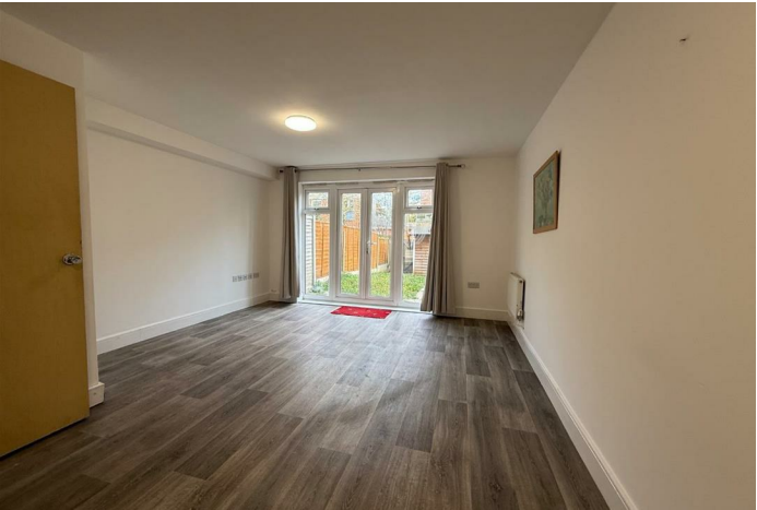
HOUSE - TERRACED (EPC RATING: C)