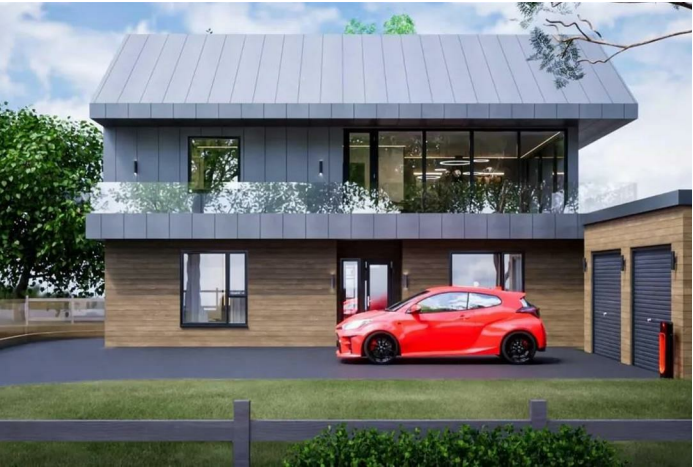
HOUSE - DETACHED (EPC RATING: )