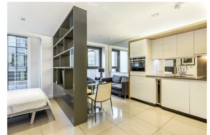
STUDIO (EPC RATING: B)

APARTMENT 505, 20 BROCK STREET, TRITON BUILDING, LONDON, NW1 3DS PER MONTH