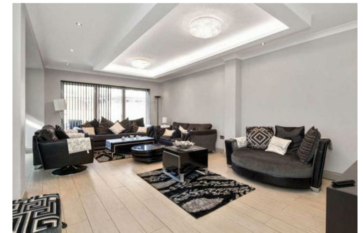
HOUSE - SEMI-DETACHED (EPC RATING: C)