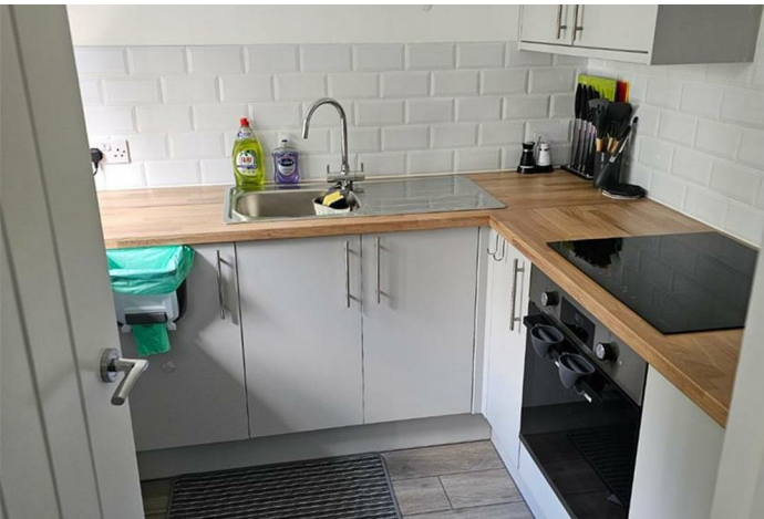
APARTMENT (EPC RATING: D)

46 HARP ISLAND CLOSE, LONDON, NW10 0DF PER MONTH £2,000 PER MONTH