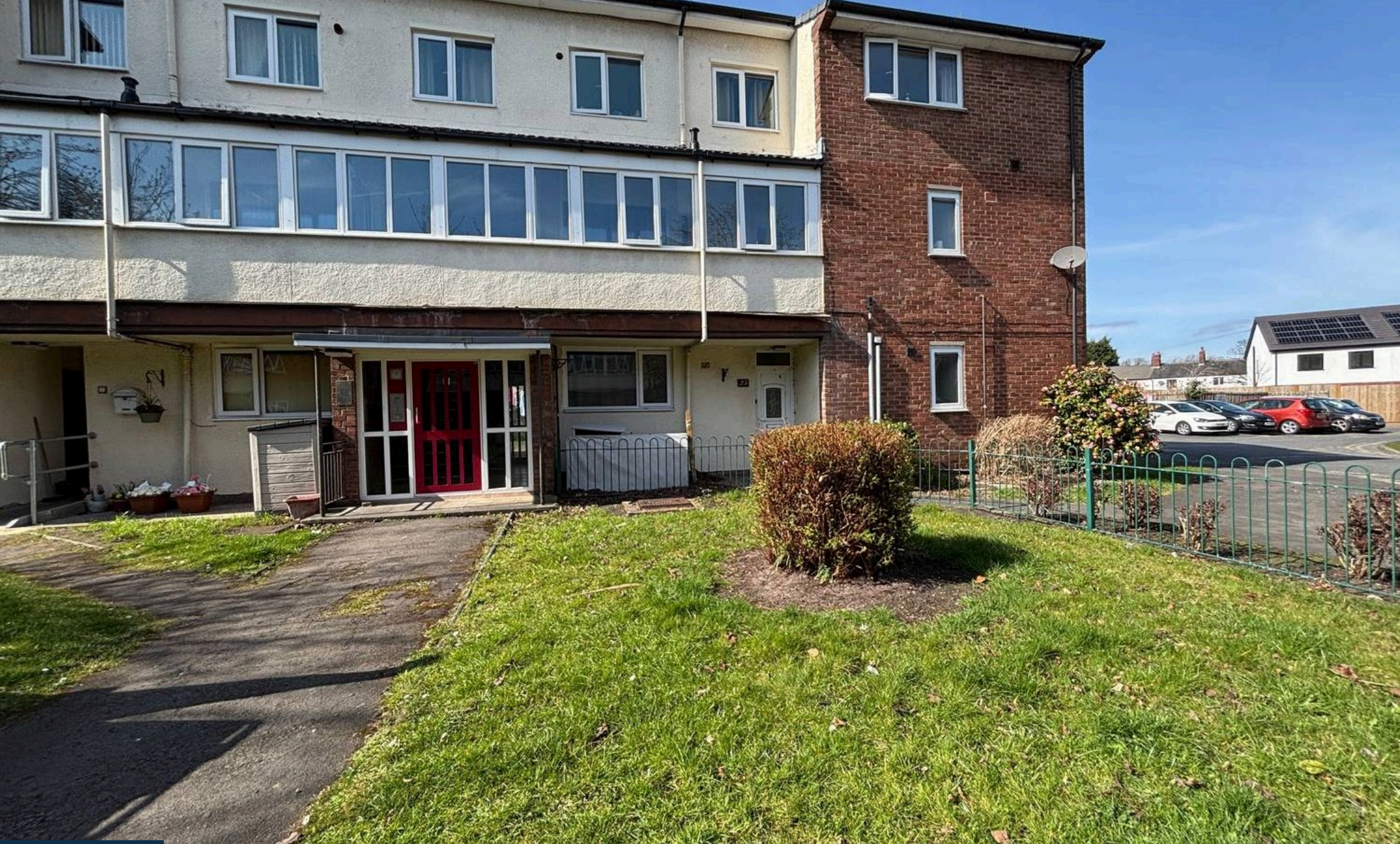
Flat 26, Stanley Court Lord Street, Burscough Offers In The Region Of £135,000