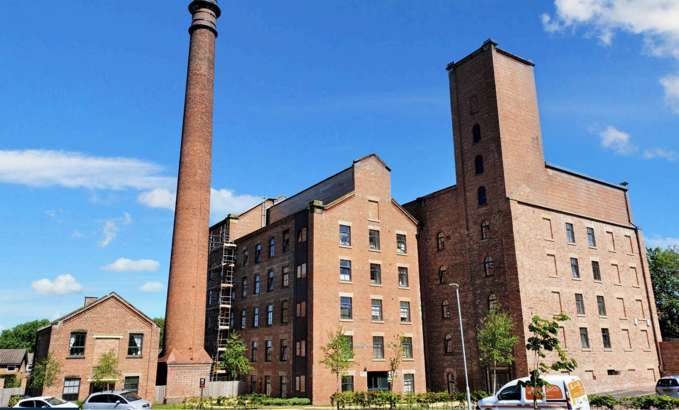
Apt 29, Ainscough Mill, Mill Lane £185,000