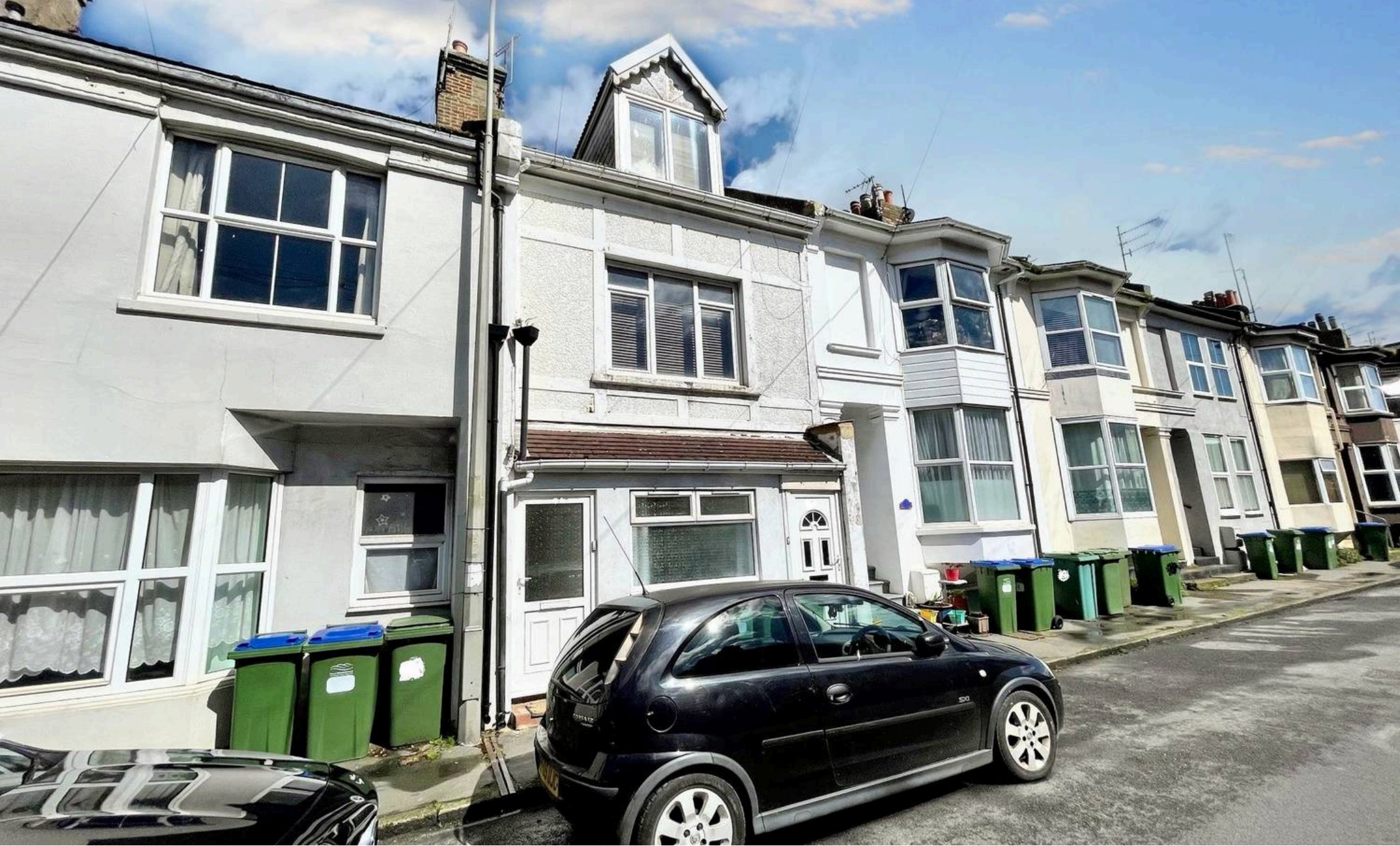
South Road, Newhaven, BN9 9QJ £975 pcm