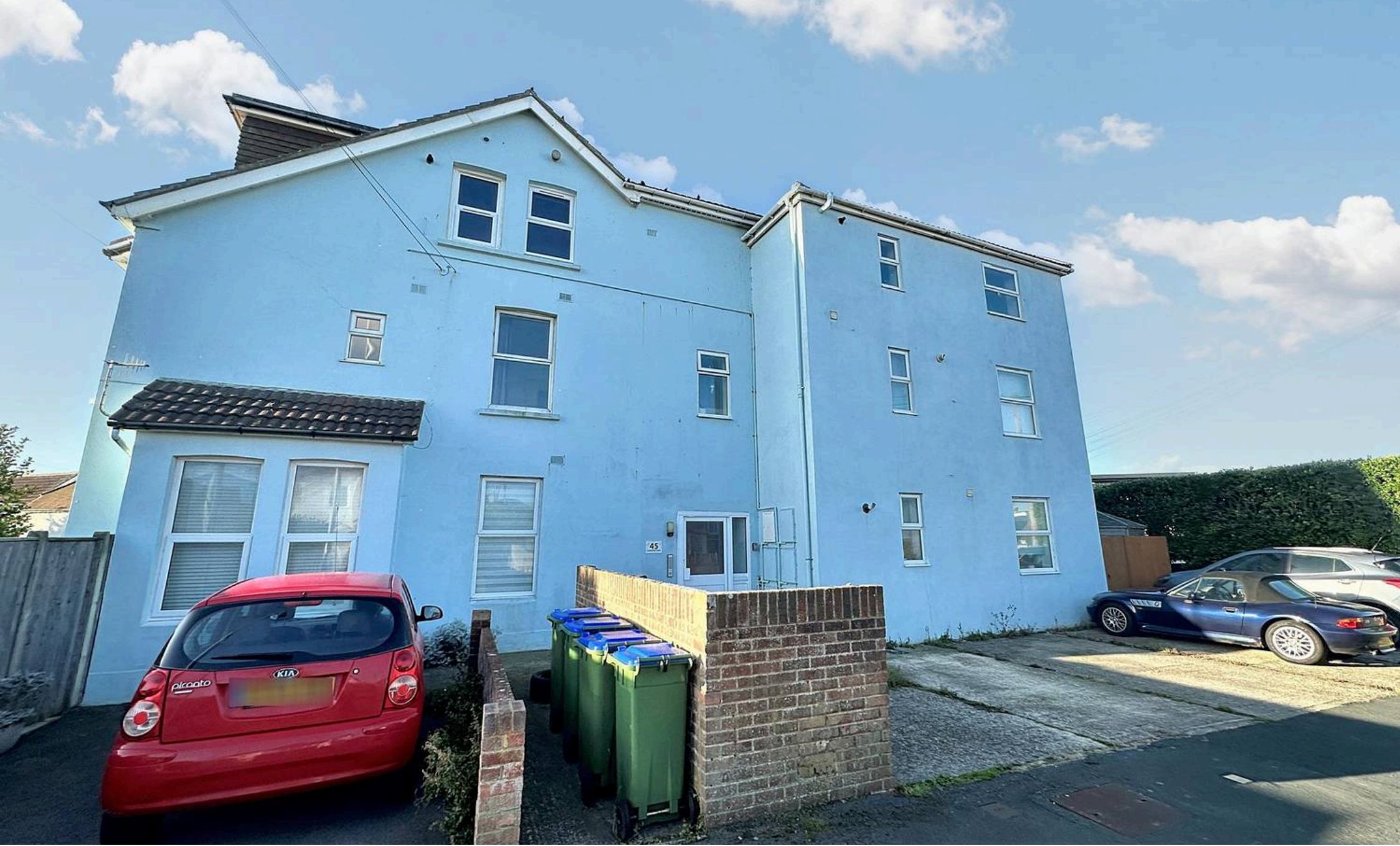
45 Claremont Road, Seaford, BN25 2QA £925 pcm