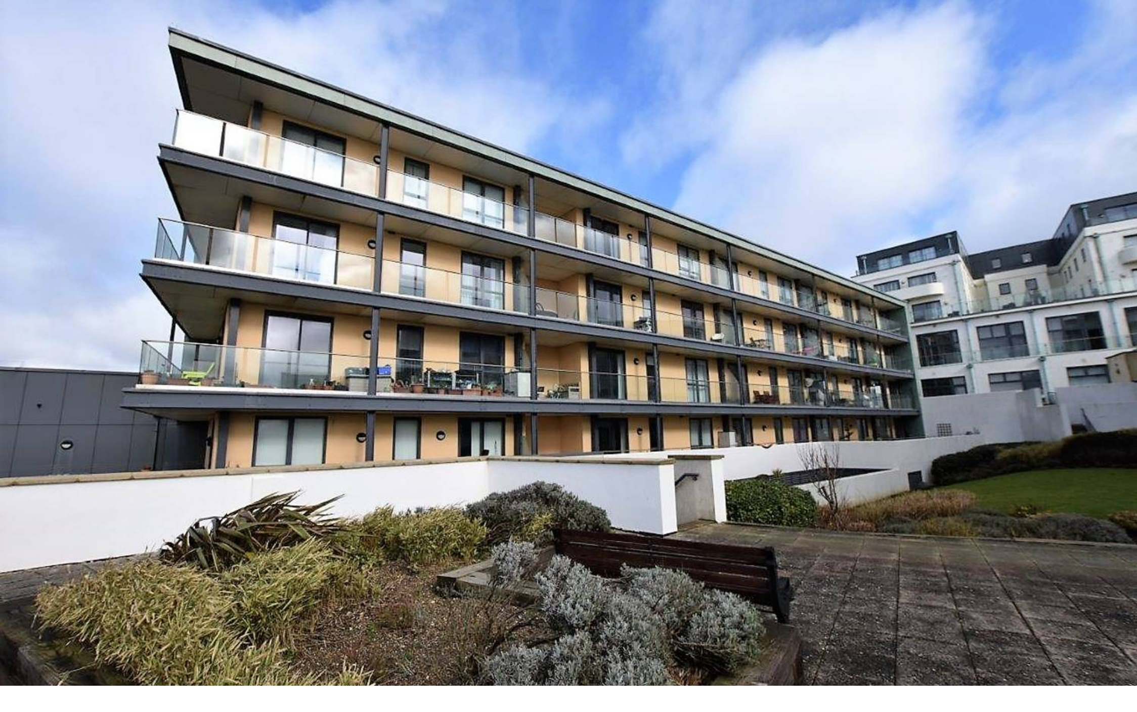
Pacific Heights, Suez Way, Saltdean, BN2 8AX £1,150 pcm