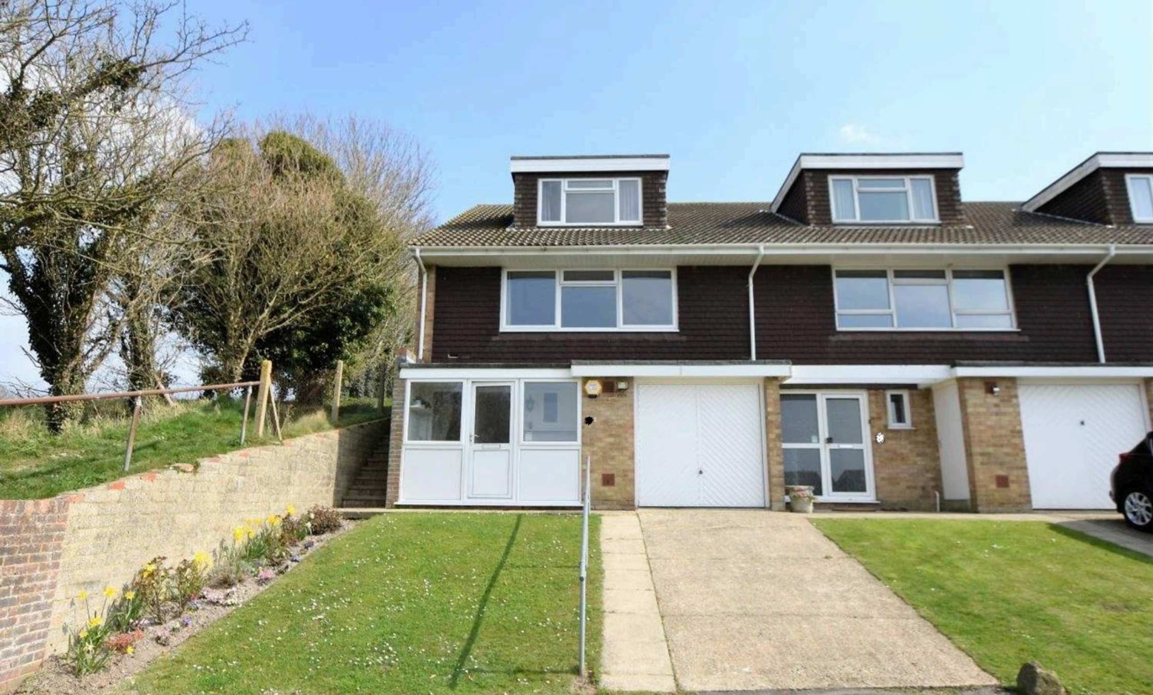
Heighton Crescent, Newhaven, BN9 0QT £1,650 pcm