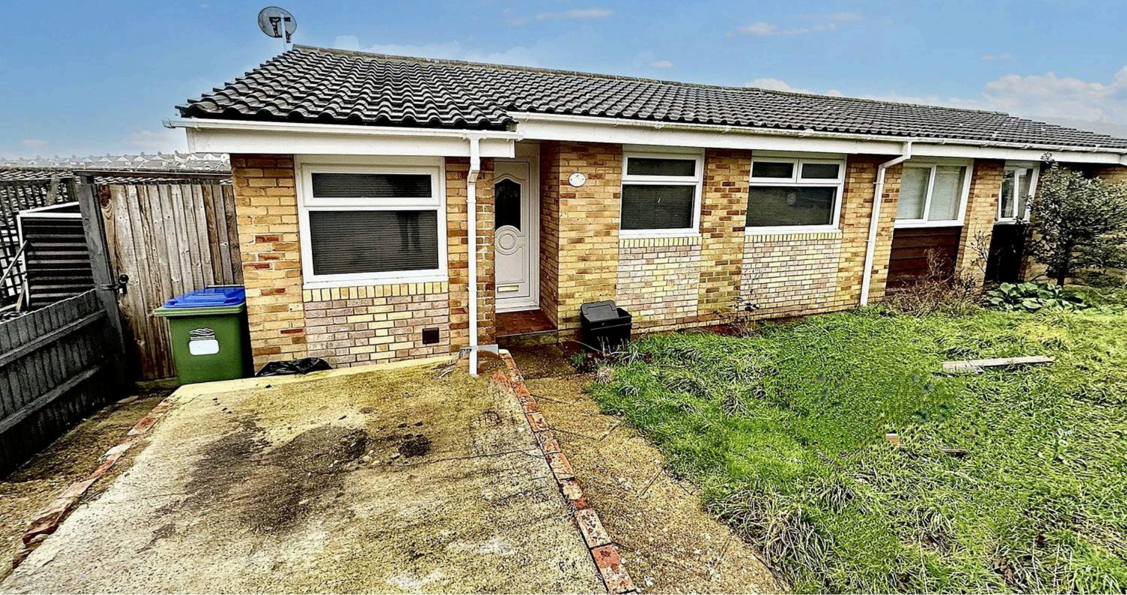
Metcalfe Avenue, Newhaven, BN9 9XP £1,500 pcm