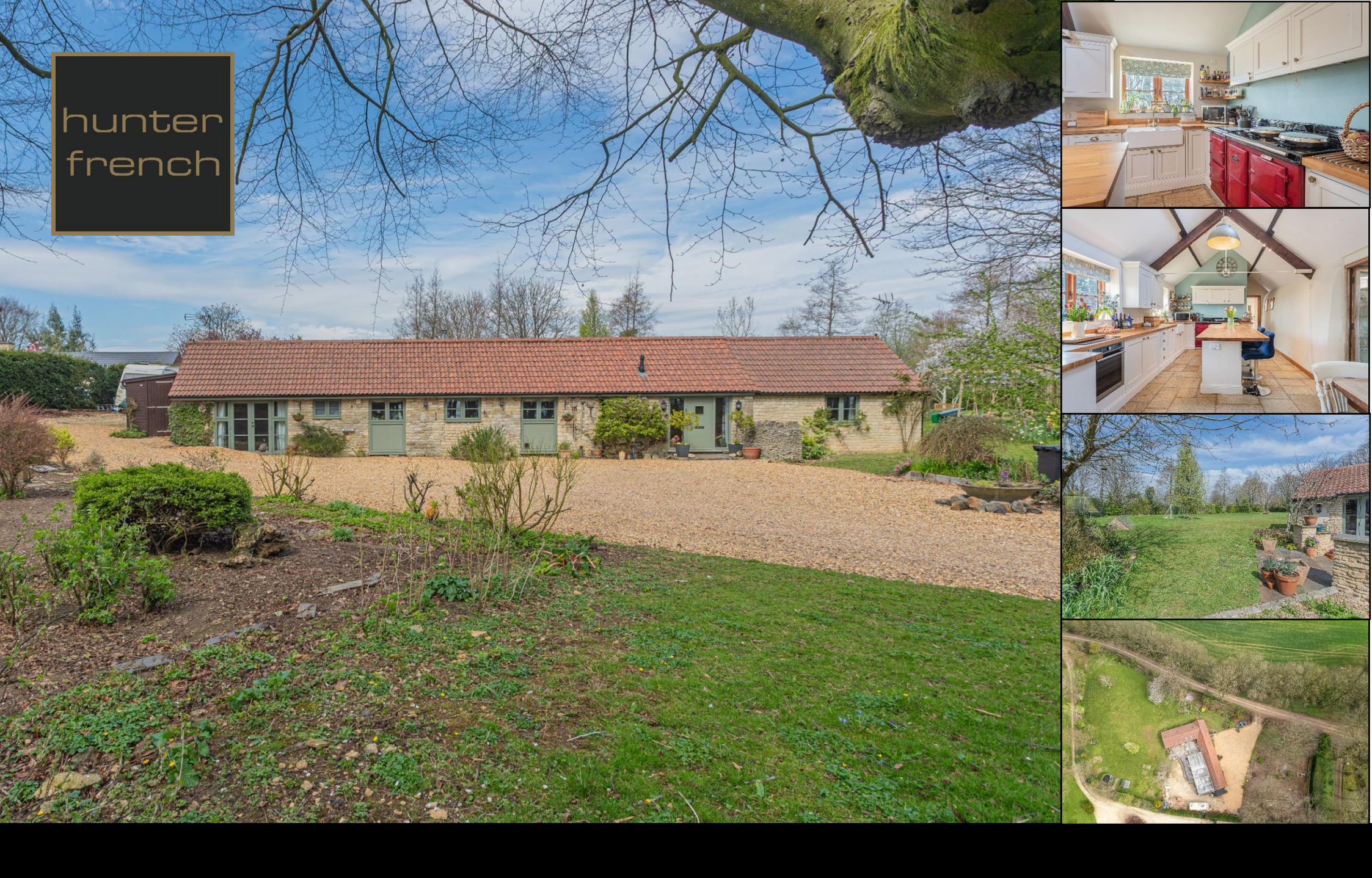
The Stables, Highfield Lane, Horton, South Gloucestershire, BS37 6QU