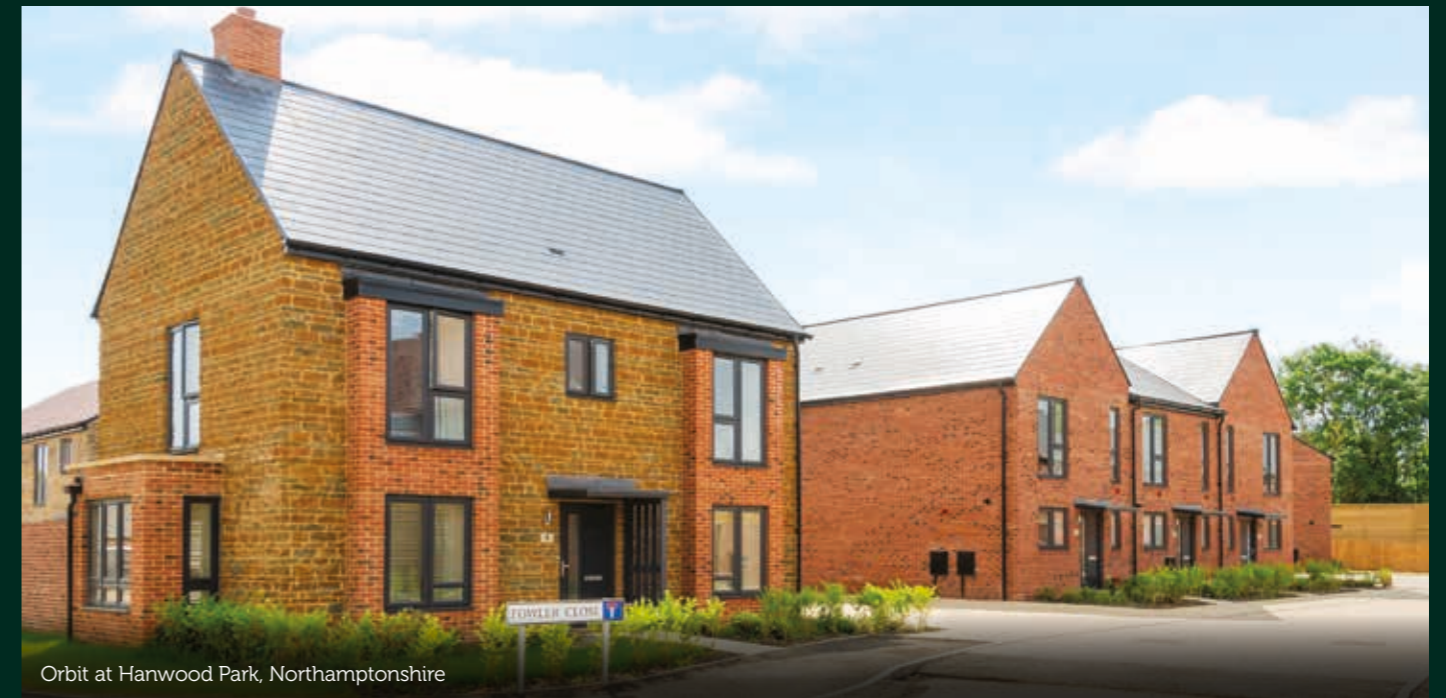
Orbit at Harwood Park, Northamptonshire