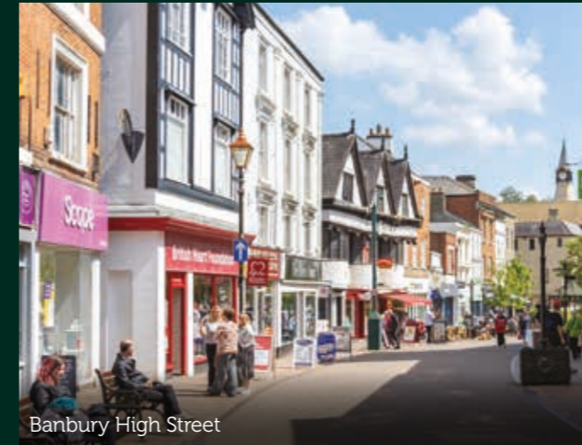
Banbury High Street

Further afield, you can explore Blenheim Palace, the birthplace of Winston Churchill, and Broughton Castle which was featured in the film "Shakespeare in Love". There are other historical houses and gardens to enjoy such as Farnborough Hall, surrounded by elegant lakes and landscaped gardens, and Stowe Gardens, with over forty temples and monuments.