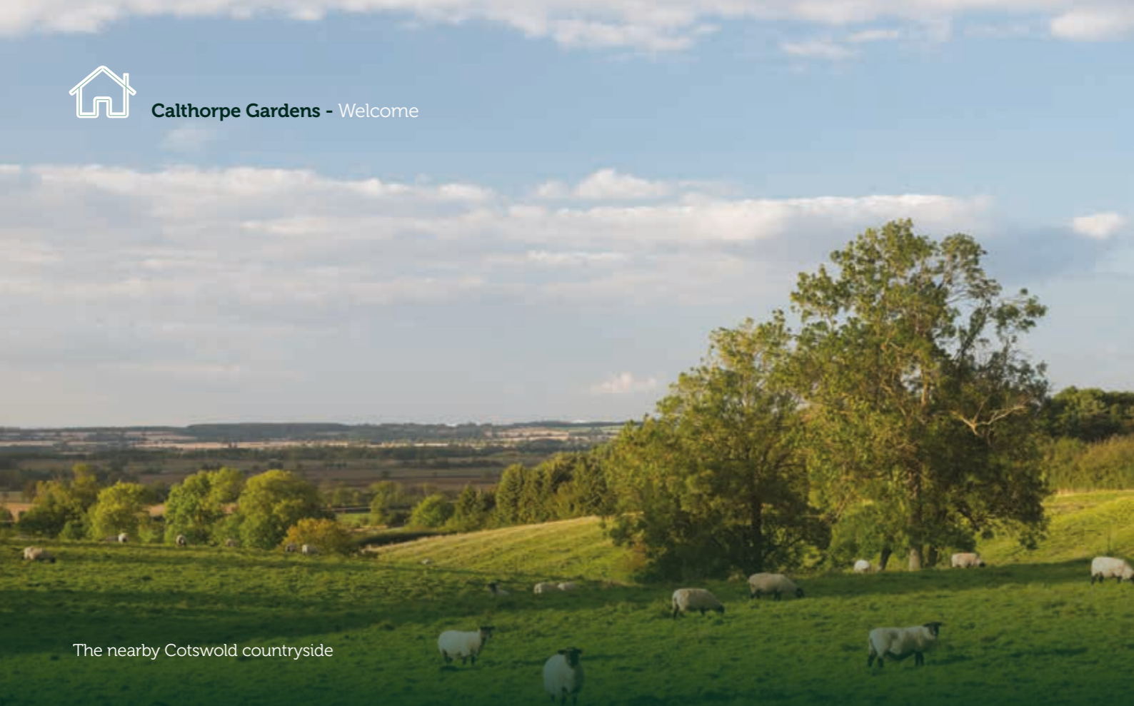
The nearby Cotswold countryside