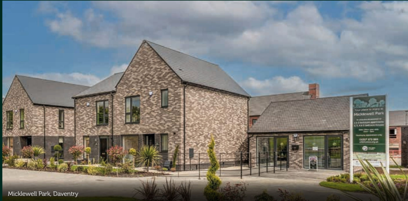
Micklewell Park, Daventry