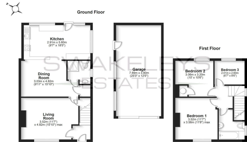
Total area: approx. 123.8 sq. metres (1332.8 sq. feet) FOR ILLUSTRATIVE PURPOSES ONLY - NOT TO SCALE. The position and size of doors, windows, appliances and other features are approximate only. Total area includes garages and outbuildings - * My Home Property Marketing - Unauthorised reproduction prohibited. Plan produced using PlanUp.

Discover the potential of this extended semi-detached home located in Harfield. This property presents a unique opportunity for those looking to put their own stamp on a home, offering a blank canvas ready for modernisation and updating.