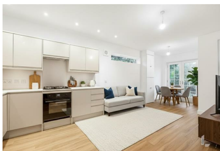
Woodcote Grove Road, CR5

Approximate Gross Internal Area = 60.5 sq m / 651 sq ft