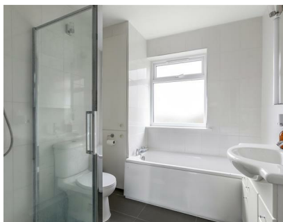
Hartley Down, CR8

Approximate Gross Internal Area 116.1 sq m / 1250 sq ft Garage / Store = 30.3 sq m / 328 sq ft Total = 146.4 sq m / 1578 sq ft