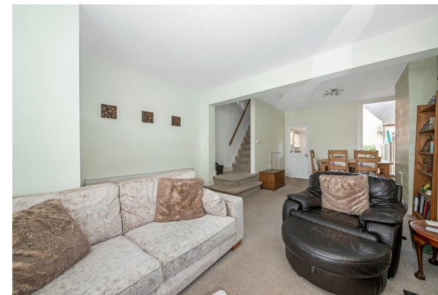
Sunnydene Road, CR8 Approximate Gross Internal Area 86.2 sq m / 928 sq ft