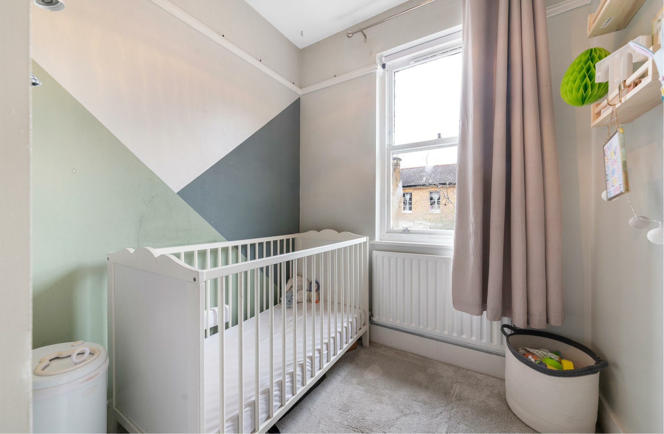
38 Elderwood Place, London, SE27 0HL