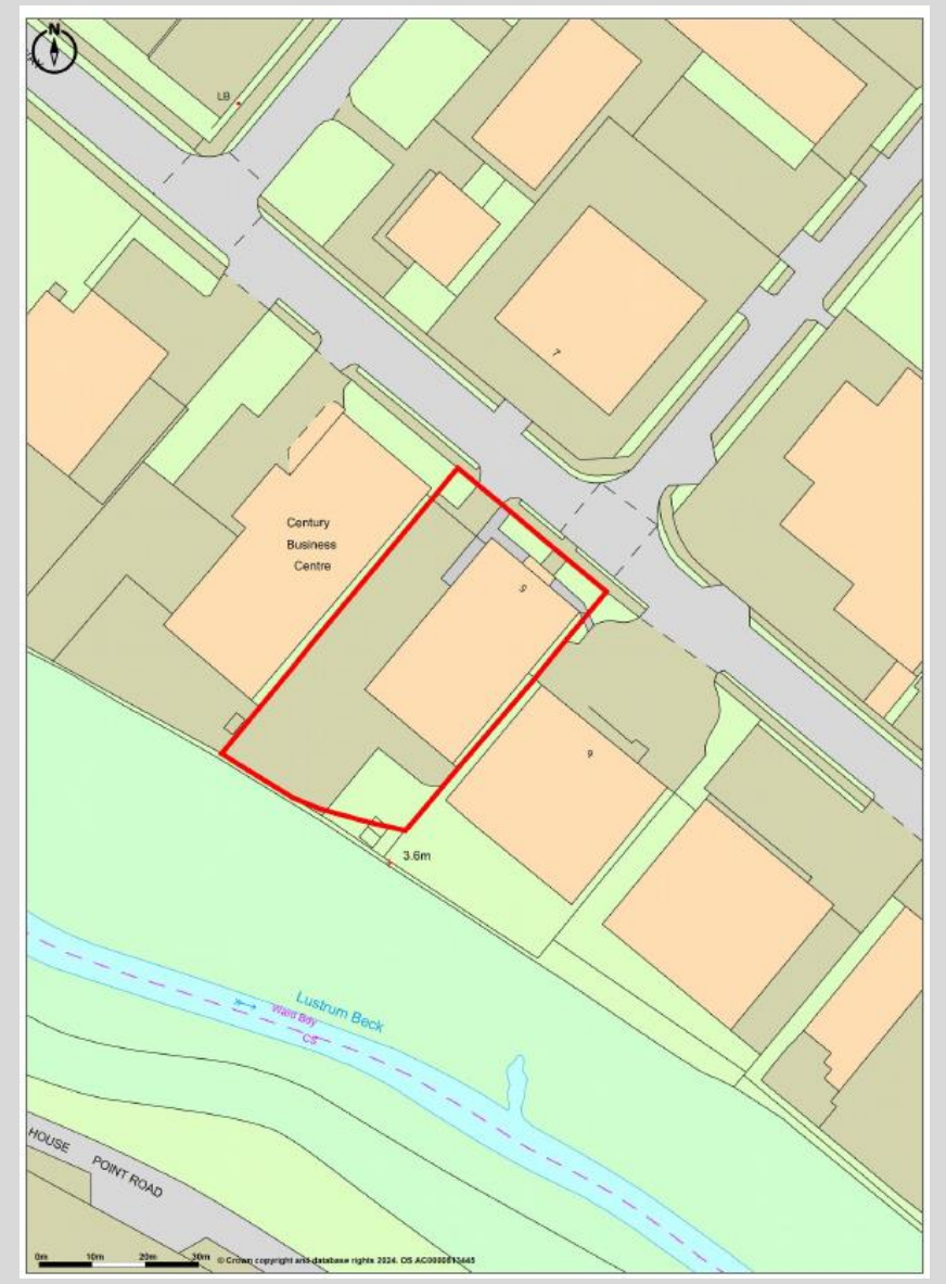
*For identification purposes only

18 St Cuthberts Way, Darlington, County Durham, DL1 1GB Telephone: 01325 466 945 enquiries@carvercommercial.com