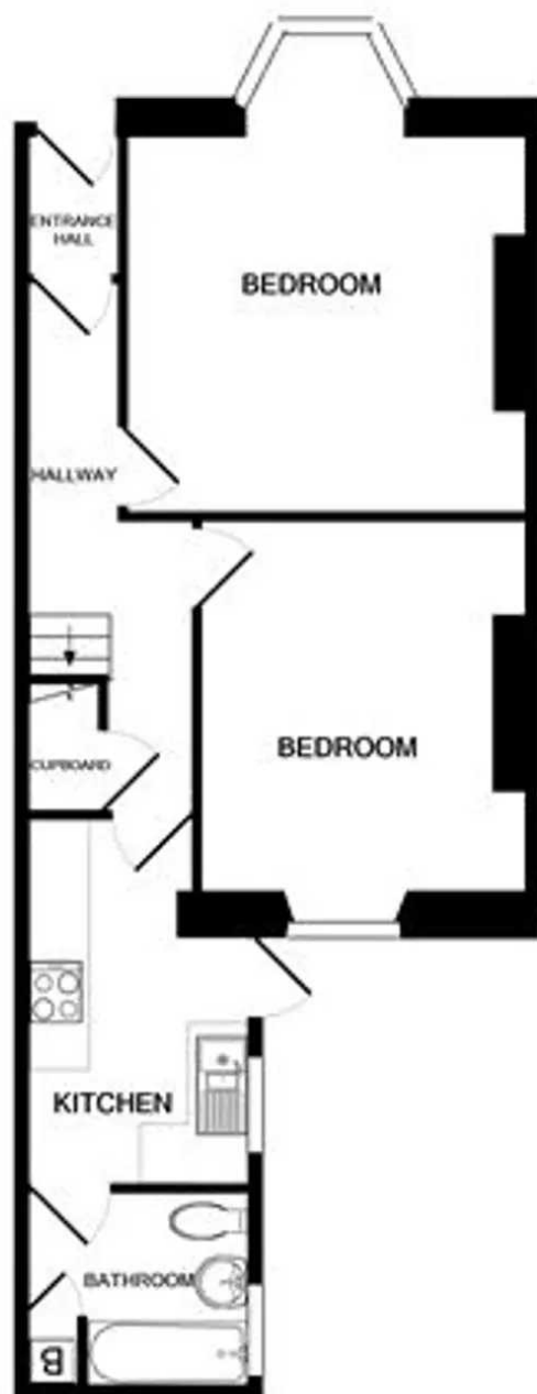
GROUND FLOOR APPROX. FLOOR AREA 505 SQ.FT. (46.9 SQ.M.)