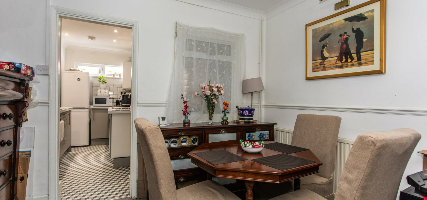
Sitting Room/Dining Room 21'5" x 10'11" (6.54 x 3.34)