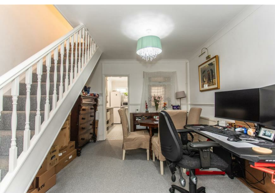
Council Tax Band C - £2208