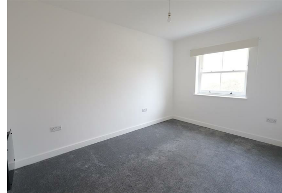
Living Room/Dining Room 27'6 x 9'10 (8.38m x 3.00m)