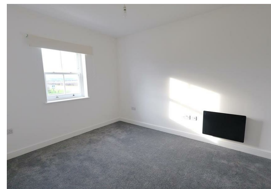
Bedroom 10'2 x 6'9 (3.10m x 2.06m)