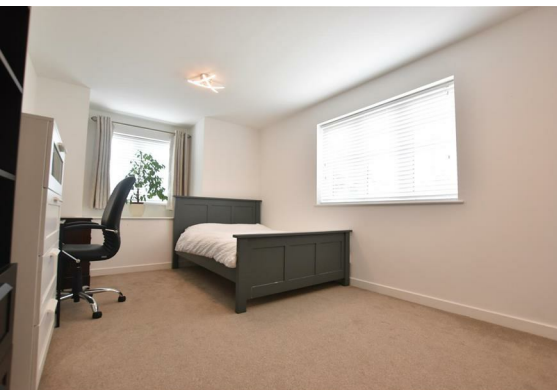
Bedroom Two 15'3" x 10'2" (4.67 x 3.12)