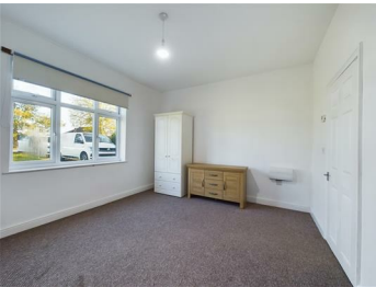
Bedroom 1 (Largest) 11'8" x 13'8" (3.57m x 4.19m)

A stylish bathroom with large tiles, a shower over the bath, and a built-in mirror on the wall. The room is completed with lino flooring and a small double-glazed window at the back, offering a relaxing space to unwind.