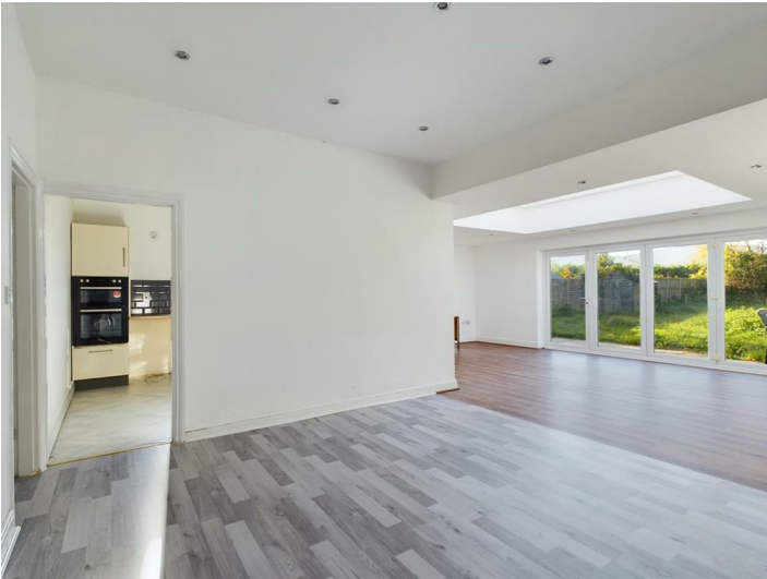
Dining Room 11'8" x 13'5" (3.58m x 4.11m)

This generous open-plan dining room features grey laminate flooring and a bright, airy atmosphere. It's perfect for family meals or entertaining guests, with direct access to the kitchen and a clear view of the garden.