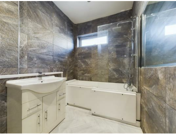
Family Bathroom 6'4" x 10'2" (1.94m x 3.10m)

A well-equipped kitchen with built-in double ovens, an electric hob, and a gas boiler. It features lino flooring and double-glazed windows, creating a functional and light-filled cooking space ideal for preparing meals.