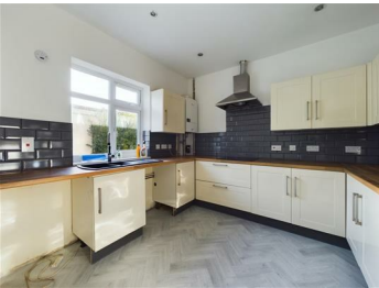
Kitchen 11'5" x 10'4" (3.50m x 3.16m)

This generous open-plan dining room features grey laminate flooring and a bright, airy atmosphere. It's perfect for family meals or entertaining guests, with direct access to the kitchen and a clear view of the garden.