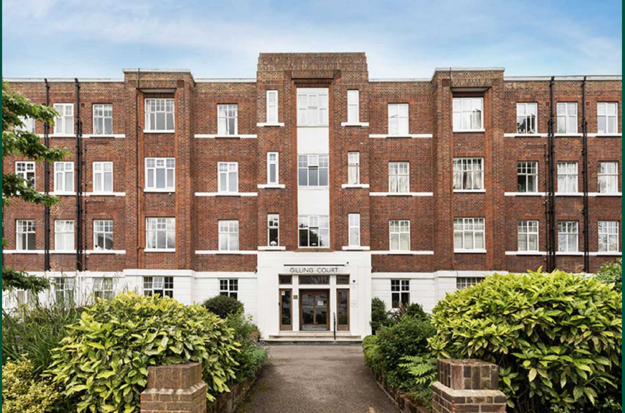
Gilling Court, Belsize Grove, London, NW3