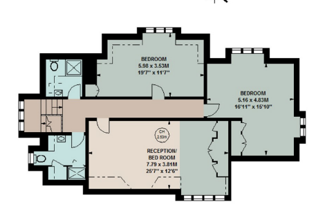
1104 sq ft Second Floor