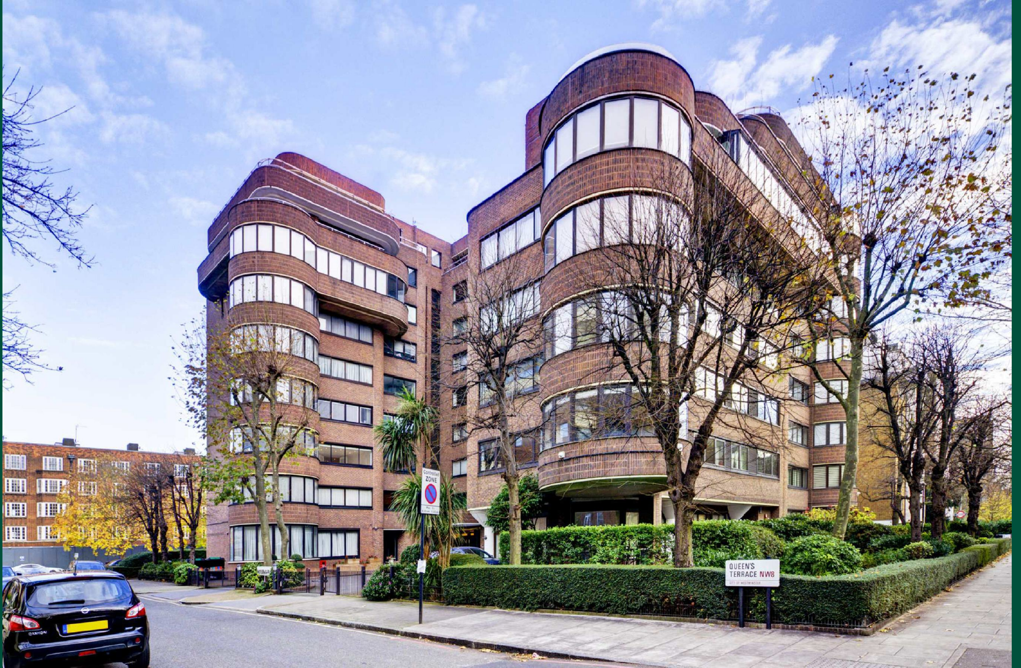
The Terraces, Queens Terrace, NW8