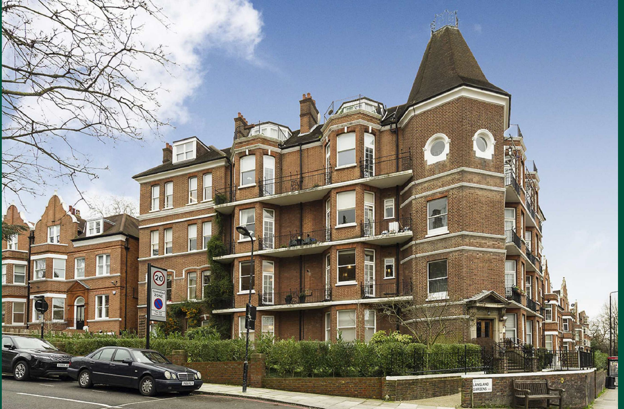
Langland Mansions, Hampstead, NW3