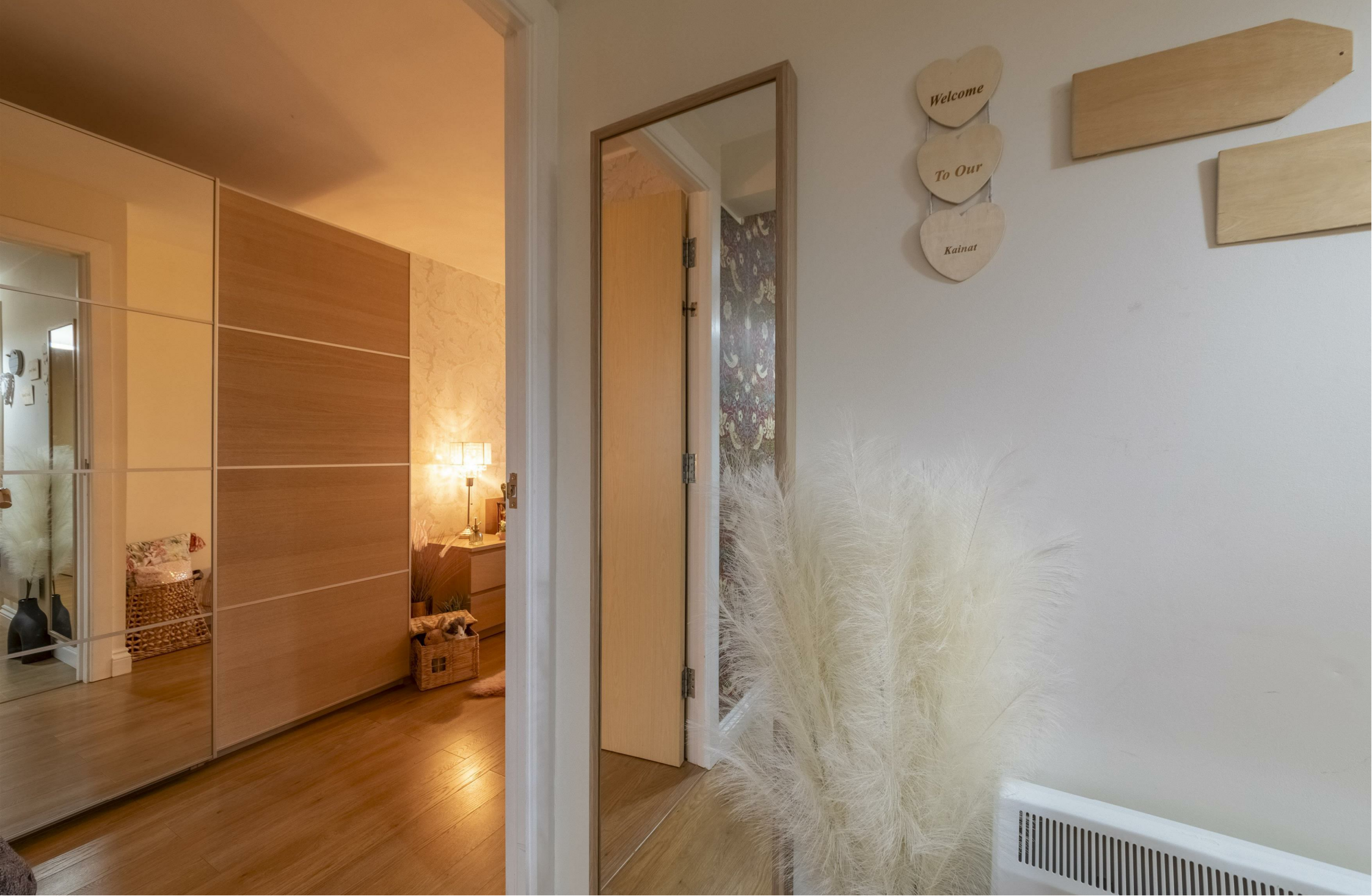
Flat 88, High Point Noel Street, Hyson Green, Nottingham, NG7 6BP