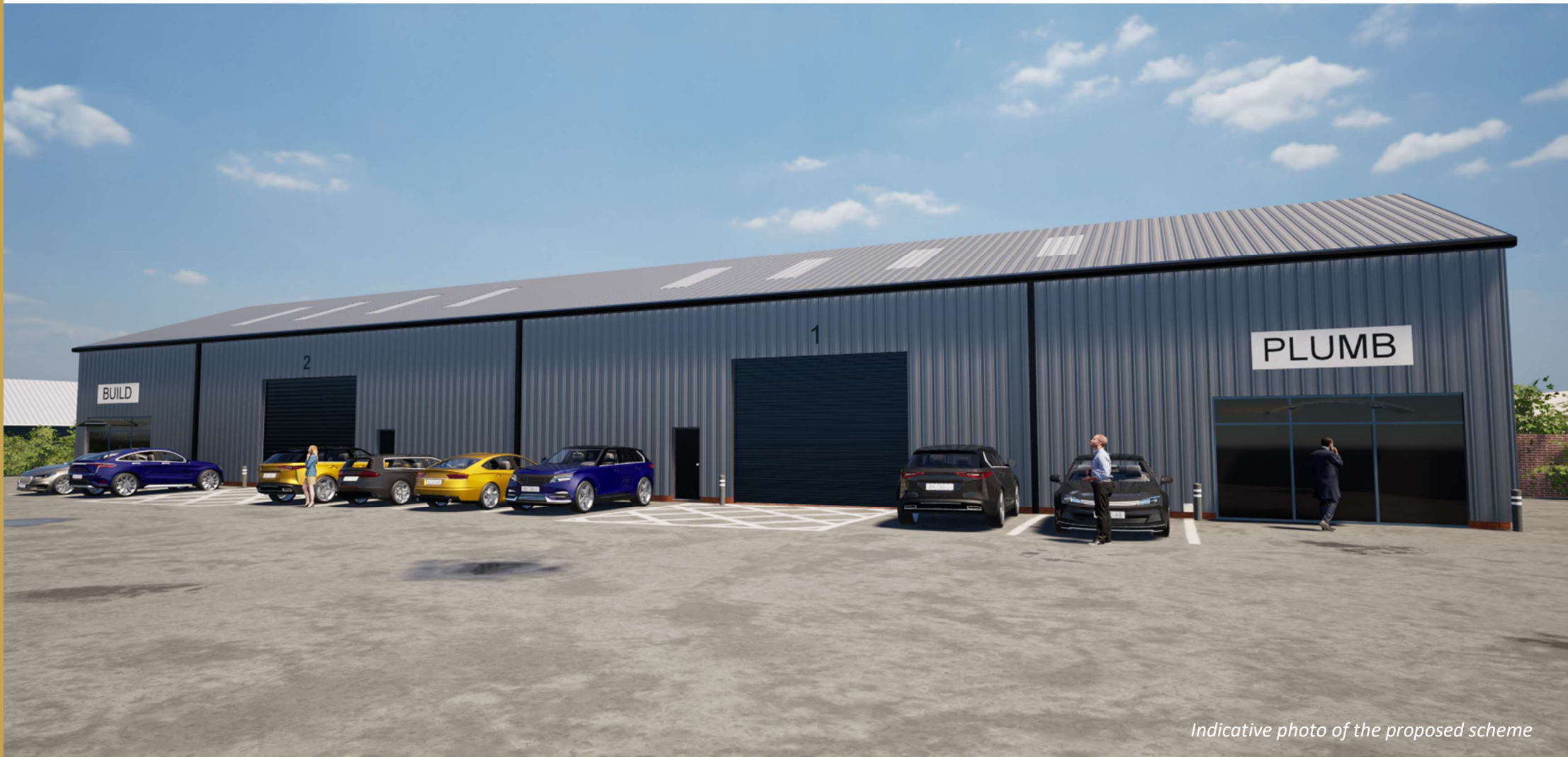
Indicative photo of the proposed scheme

BUILDERS MERCHANT / TRADE UNITS, WHEATLEY HALL ROAD, DONCASTER DN1 2TE