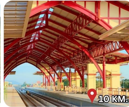
HUA HIN TRAIN STATION