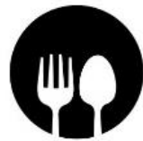
RESTAURANTS THAI/INDIAN/ITALIAN KITCHEN