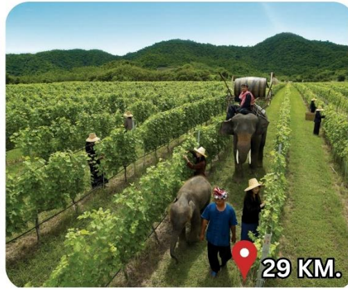
MONSOON VALLEY VINEYARD HUA HIN