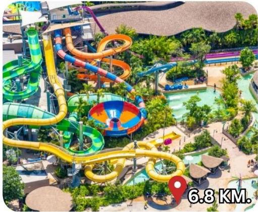
VANA NAVA WATER JUNGLE