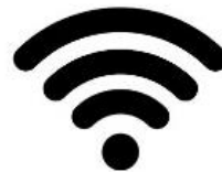
HI SPEED FIBER OPTIC INTERNET