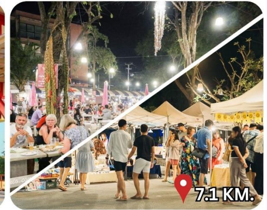
TAMARIND MARKET CICADA MARKET