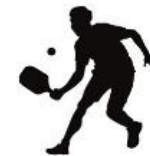
RECREATIONAL FACILITIES PICKLEBALL/BADMINTON/GYM