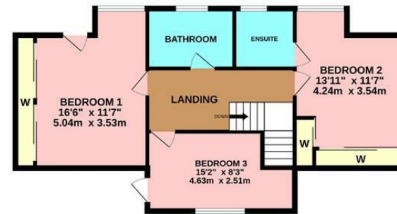
1ST FLOOR 695 sq.ft. (64.6 sq.m.) approx.