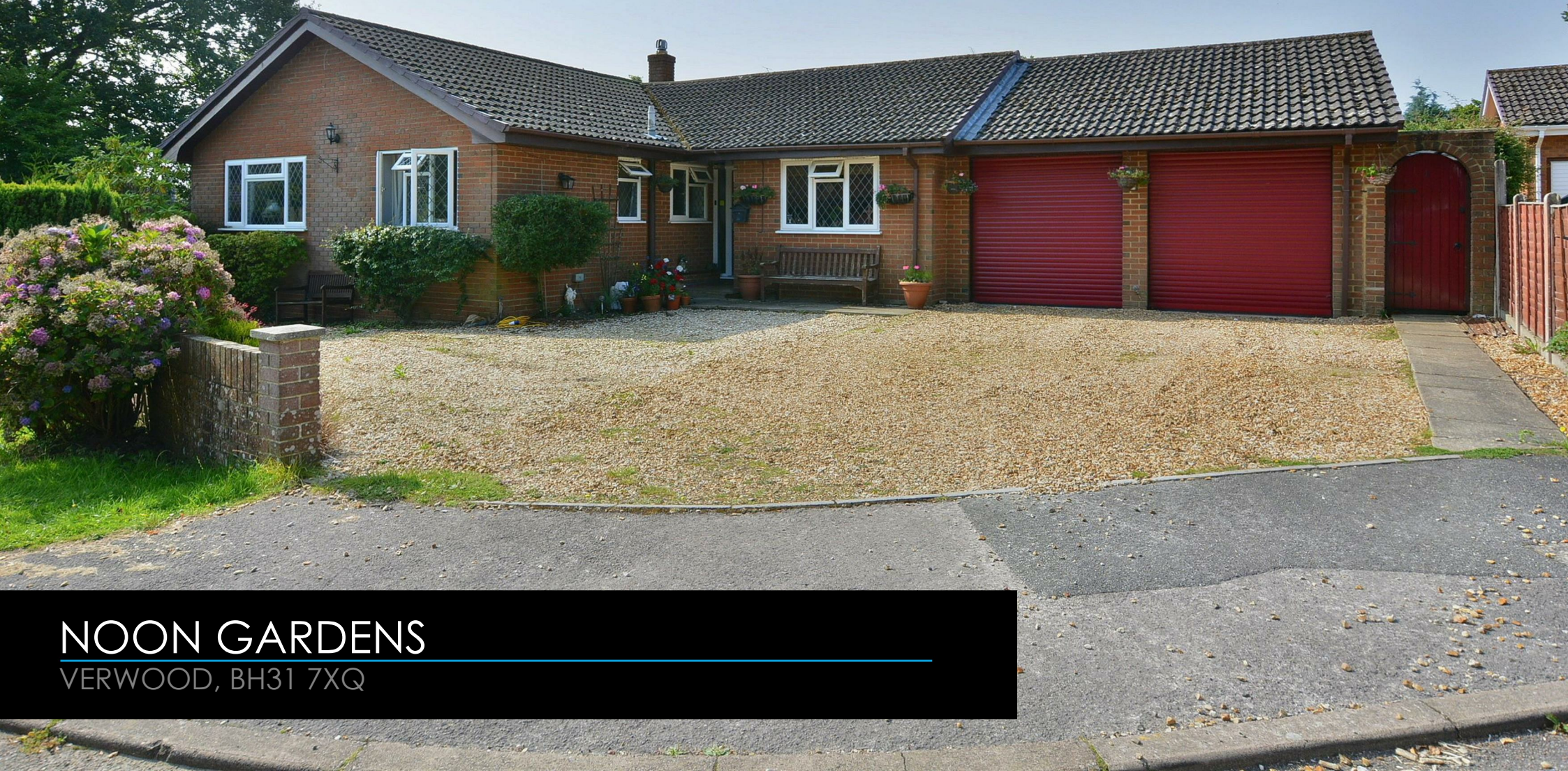
NOON GARDENS VERWOOD, BH31 7XQ