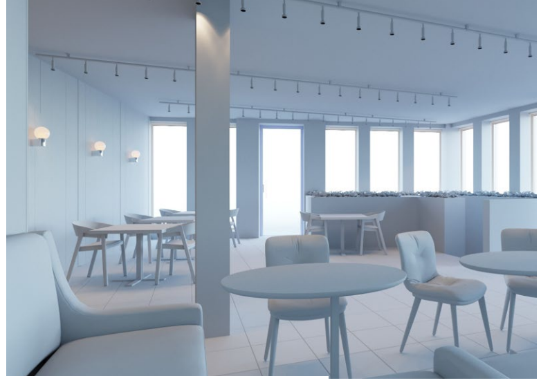
UNFINISHED INTERNAL CGI