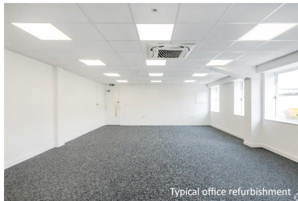
Typical office refurbishment

Terms: The premises are available on a new full repairing and insuring lease, for a term to be agreed.