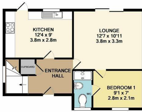
GROUND FLOOR APPROX. FLOOR AREA 415 SQ.FT. (38.6 SQ.M.)