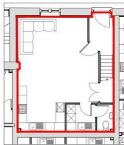
Ground floor plan Scale 1:100 at A3