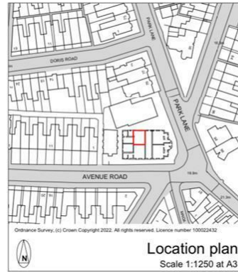
Location plan Scale 1:1250 at A3