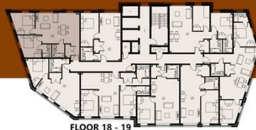
FLOOR 18 - 19