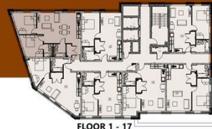
FLOOR 1 - 17