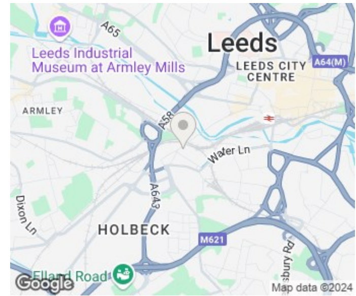
Springwell Gardens Apartment - A107