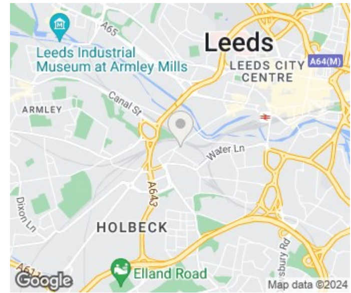
Springwell Gardens Apartment - A107