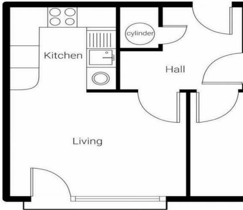
Floorplan for 1 bedroom flat for sale