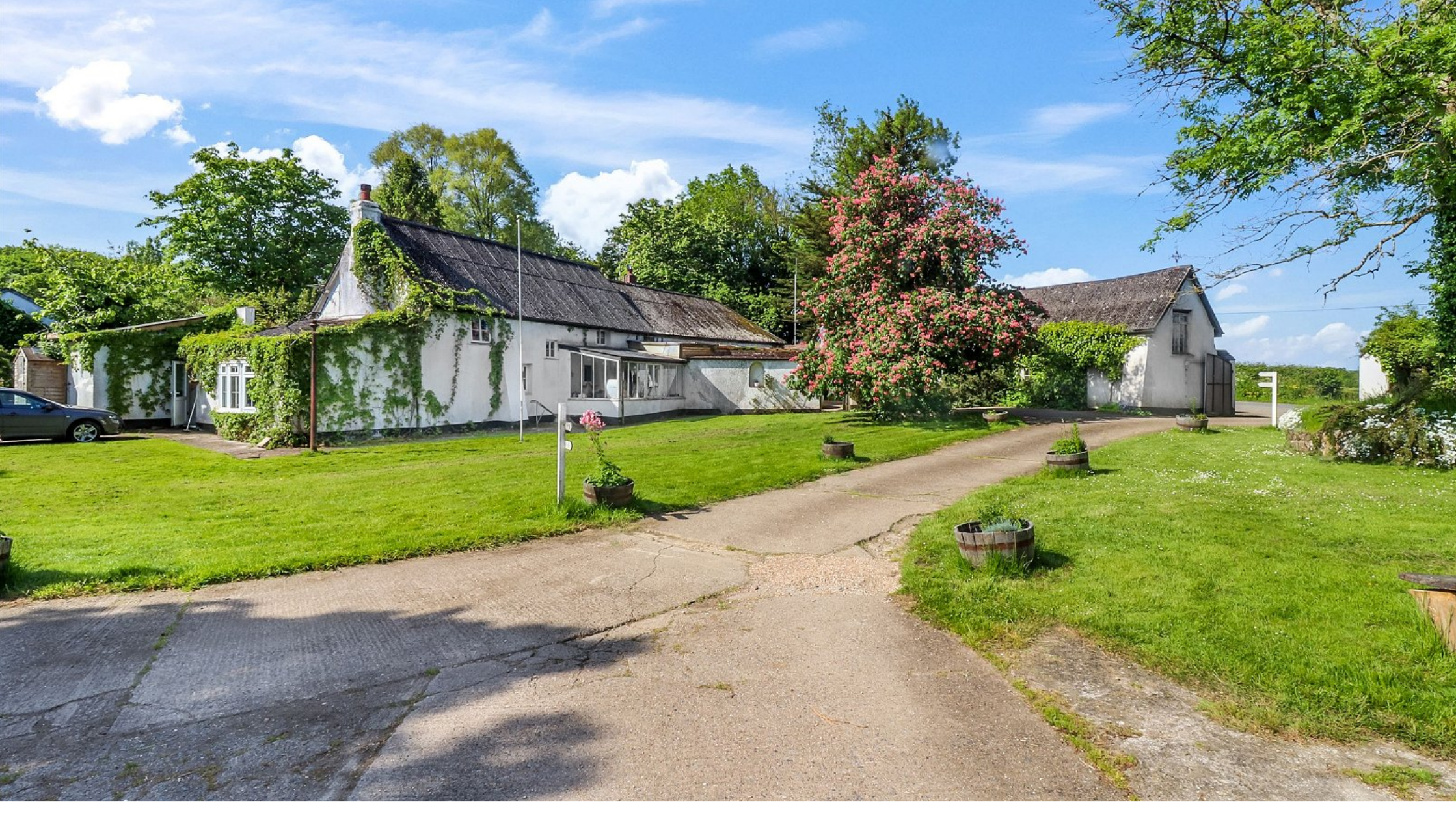
Black Torrington, Beaworthy, EX21 5QH