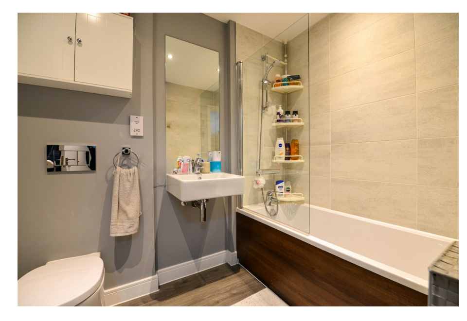
Tax Band: C Furnished: Ask agent

Modern two bedroom apartment offering a private balcony, allocated parking and a lovely new finish. PET FRIENDLY