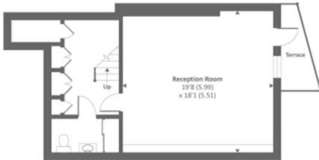
Lower Ground floor