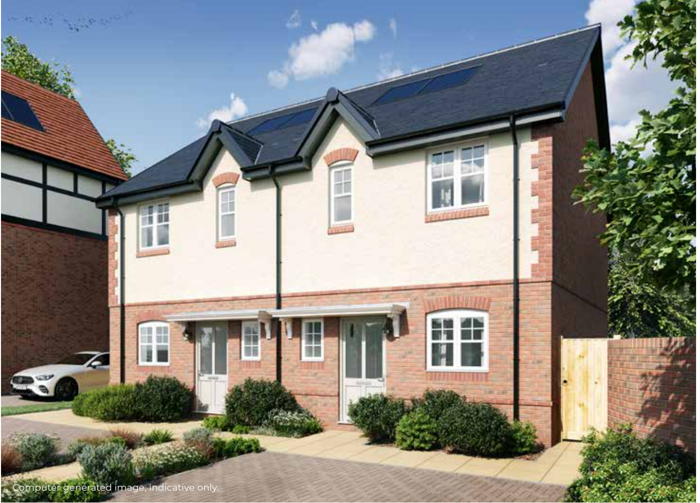
Computer generated image, indicative only.