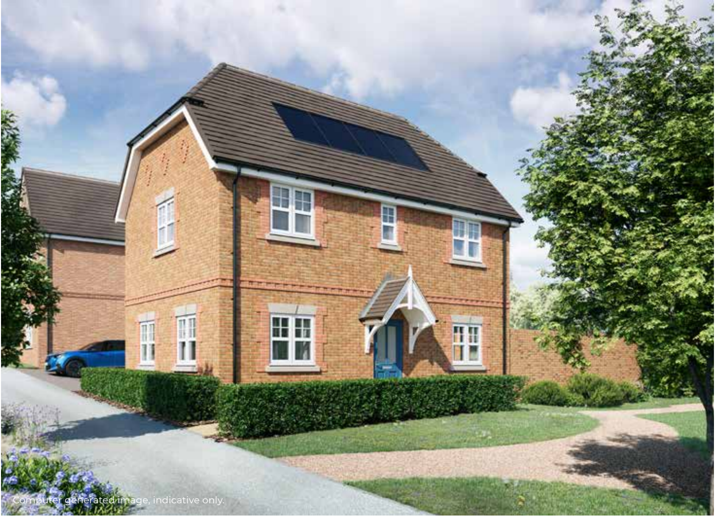
Computer generated image, indicative only.