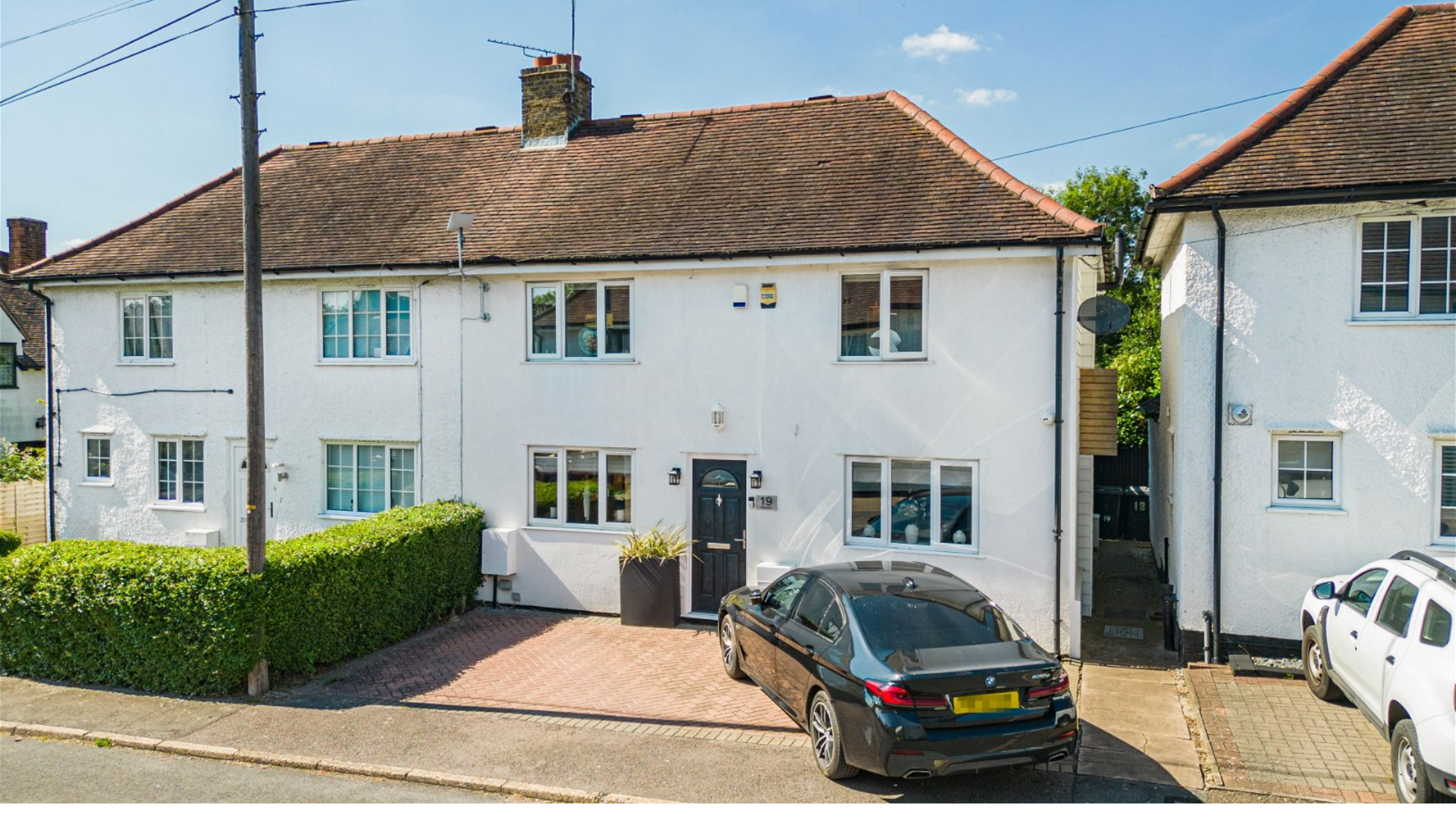
Mansfield, High Wych, Sawbridgeworth, CM21 0JT