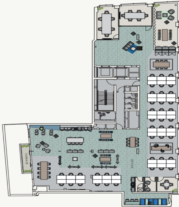
First Floor Fitout 5,500 sq ft / 511 sq m